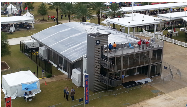
Hybrid Container Structure