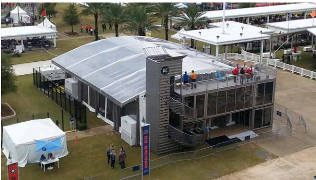
Hybrid Container Structure