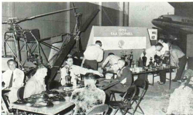
Awards Committee at work