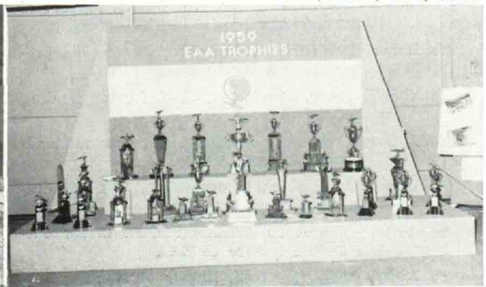
Some of the 1959 Trophies