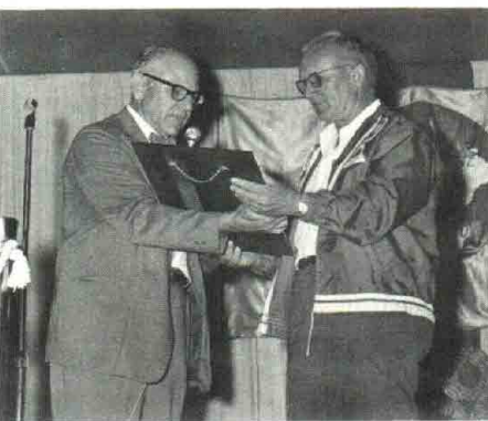
Curtiss Pitts receives the August Raspert award.