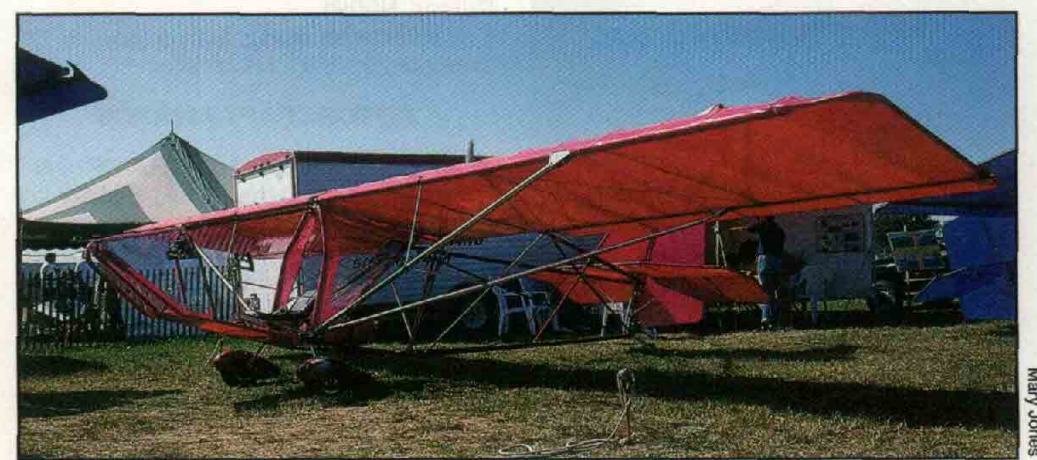
Ultralight Honorable Mention - T-Bird owned by Kevin Gascon, Grimes, IA. The T-Bird is manufactured by Golden Circle Air of Grimes.