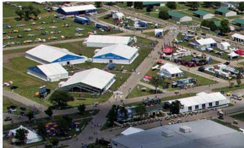
EXHIBIT AT AIRVENTURE

“EAA is a great organization that does an exceptional job of bringing people to you. There’s no better example of that than EAA AirVenture Oshkosh. They’ve got an incredible draw of over half a million people annually and people come here to this event specifically to look for solutions. So, if you really want to reach a customer that’s in the buying mood, there’s no better place than AirVenture.”