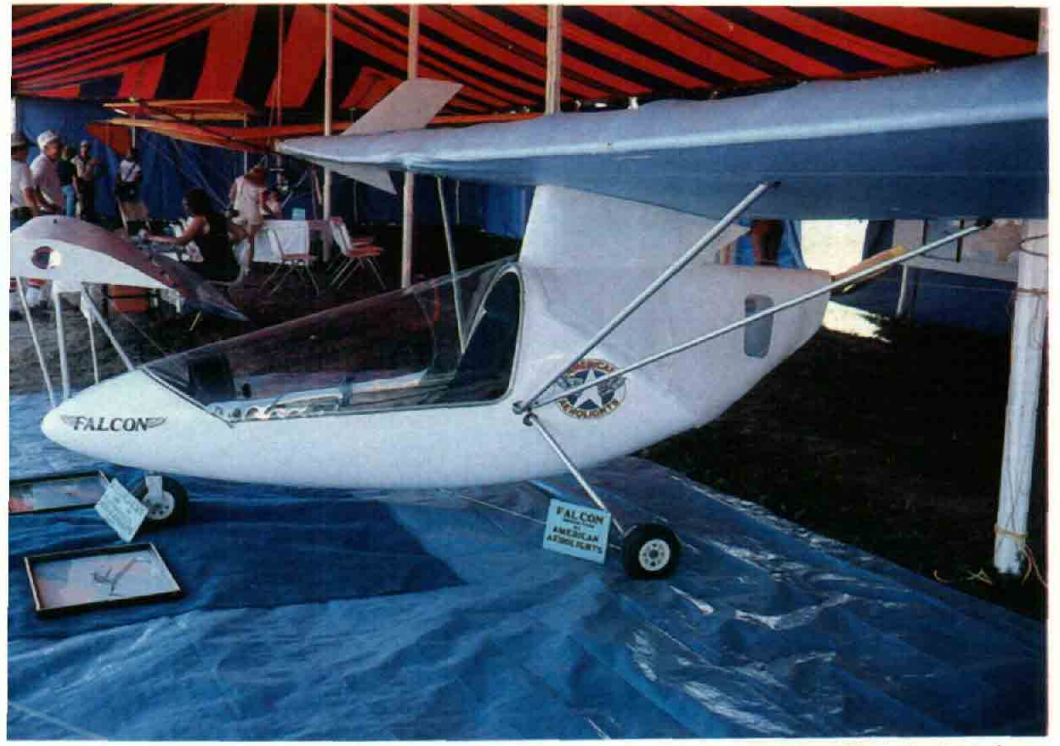
American Aerolight's Falcon prototype — on static display at Oshkosh.