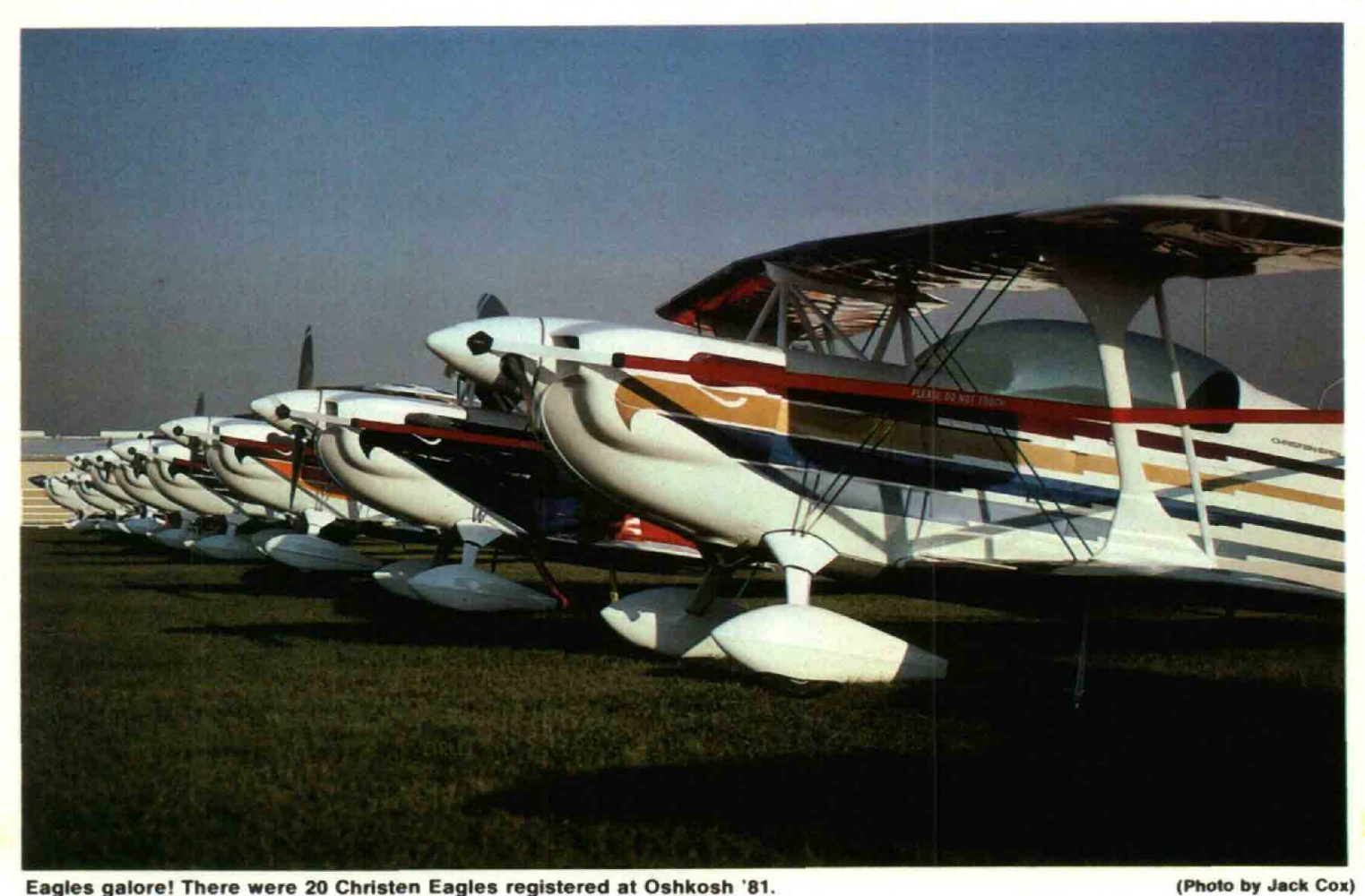
Eagles galore! There were 20 Christen Eagles registered at Oshkosh '81.