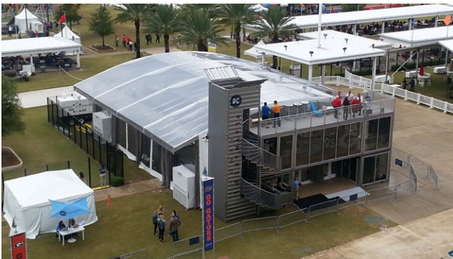
Hybrid Container Structure